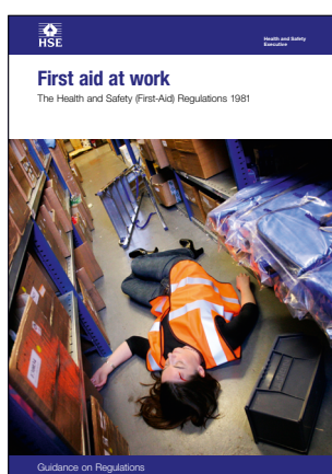
L74 (Third edition) Published 2013

This is a free-to-download, web-friendly version of L74 (Third edition, published 2013 – reissued with minor amendments in 2018). This version has been adapted for online use from HSE’s current printed version.